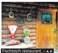
Fischteich restaurant. :: A. F.