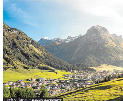
Lech village. :: HANNO MACKOWITZ