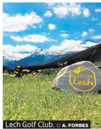
Lech Golf Club.

chance to enjoy the last warm rays of the day's sun. www.airbds