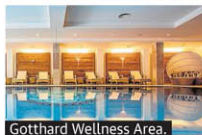
Gotthard Wellness Area.