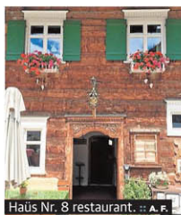
Haus Nr. 8 restaurant. :: A. F.