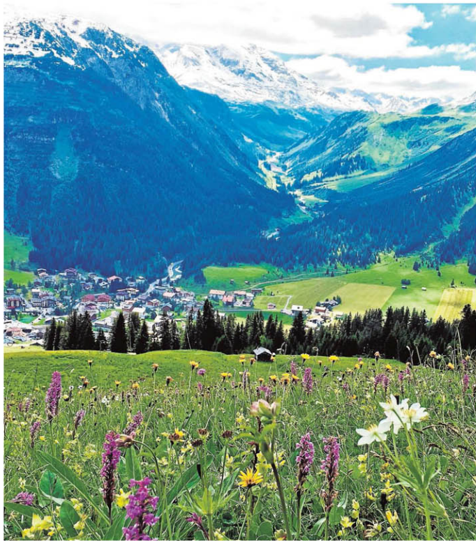
The summer landscape is stunning, lush with wild flowers.

Today's schnapps, enjoyed on the farmhouse terrace, was made by local farmers who each year return to the summer alpine area to graze cattle, make cheese and, well, from the