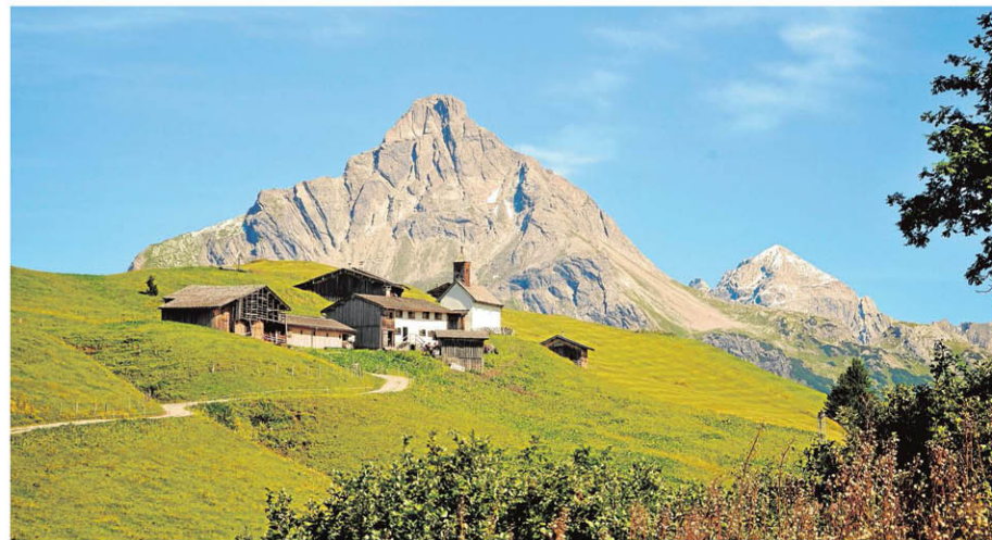
The historic hamlet of Bürstegg was built by medieval Alpine settlers.

The walking route also offers glimpses of life as it once was in these striking valleys. Our mid-point stop at this ancient farmhouse, in the historic hamlet of Bürstegg, is a chance to experience a snapshot of rural Alpine life. The hamlet was built by the Walsers, medieval Alpine settlers. Buildings here date back centuries, some as old as 700 years. Beside the farm-