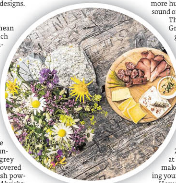
An Alpine snack. :: DENER VORARBERG.TRAVEL

From the room my morning perspective was somewhat different to that now later in the day, high up in the tiny community at Bürstegg.